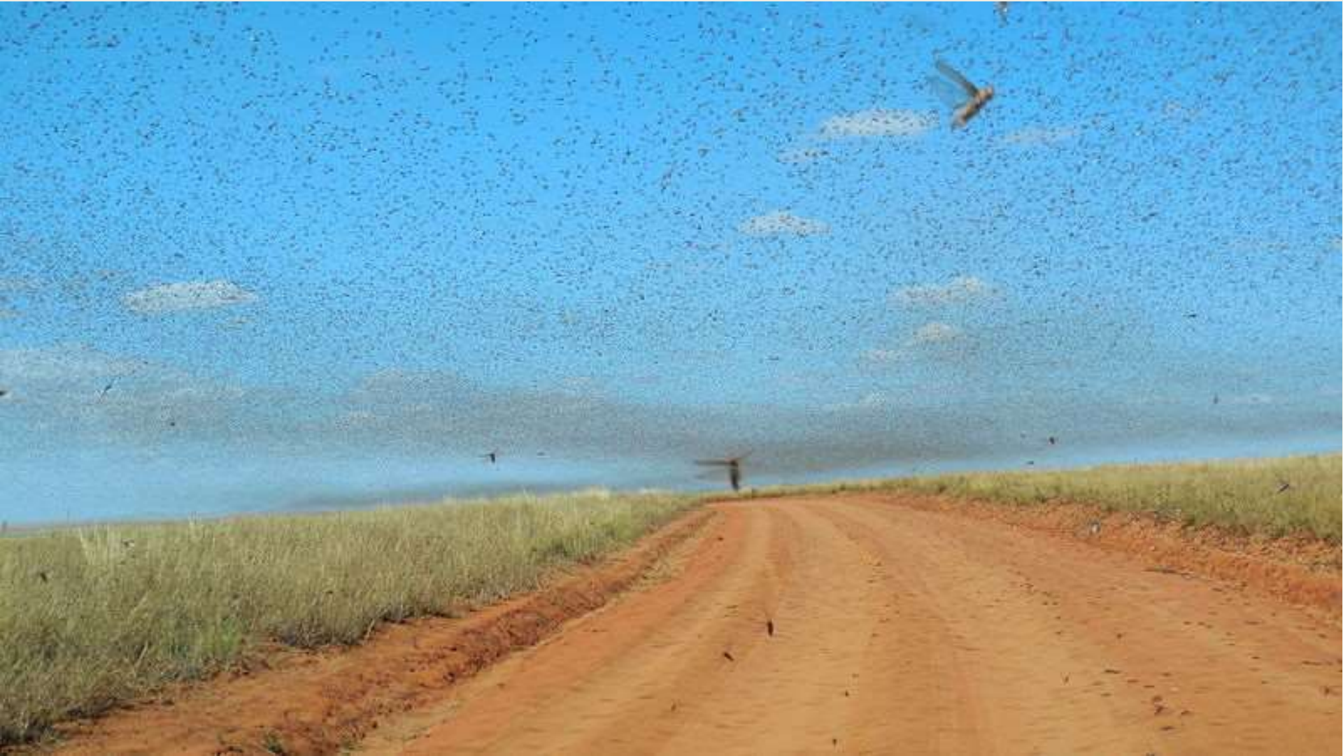
Locust Swarm, Madagascar May 2014